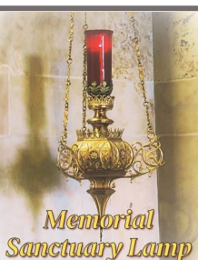
Memorial Sanctuary Lamp