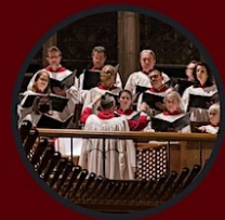
St. Agnes Cathedral Choir of the Diocese of Rockville Centre

4:30 pm: Mass at St. Patrick’s Cathedral 5:15 pm: Procession Through Manhattan 6:00 pm: Procession Ends at St. Patrick’s Cathedral 6:00 pm: Benediction 6:30 pm: Event Concludes