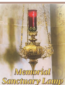
Memorial Sanctuary Lamp