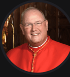
His Eminence Timothy Cardinal Dolan Benediction

2pm: Veneration of Blessed Carlo Acutis Relic