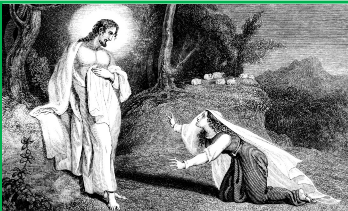
St. Mary Magdalene July 22

Jesus prefers to teach outdoors rather than in a stuffy academic box. His parable appeals to a rural audience. The four types of soil represent various ways people respond to the Word of God.